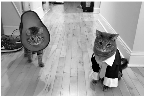
Dali and Bubbles very patiently dressed as an Avo(cat)o and an Abo-gato (lawyer in Spanish) for Halloween