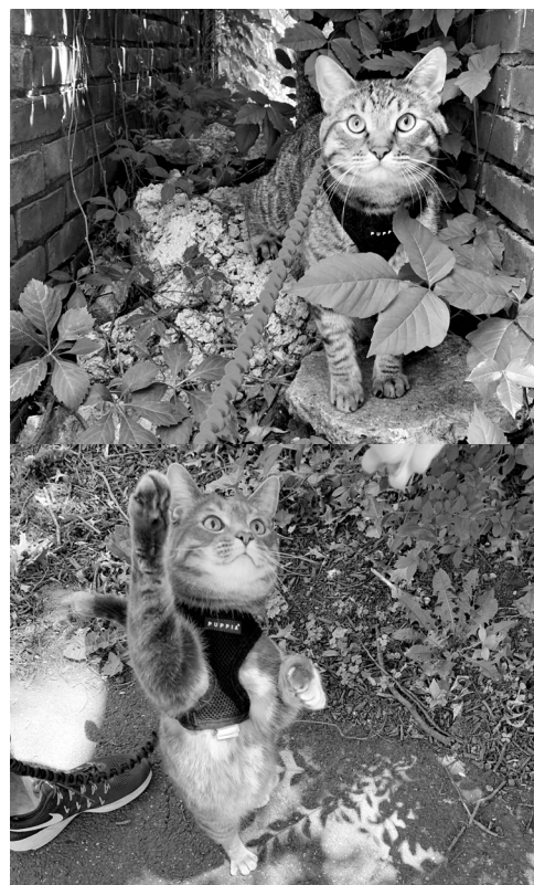
Dali and Bubbles enjoying their walks

Recently, Ellen commented: "It's been very rewarding to work with the cat project and with all the other wonderful volunteers. I've been very impressed with all that GNHCP is able to accomplish, and how dedicated the volunteers are." The truth is that GNHCP is equally grateful to have such a wonderful, creative and generous volunteer in Ellen.