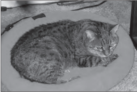
In memoriam: Princess, 9/5/95-2/27/10