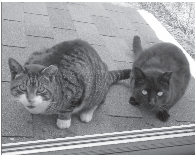
Stripes and Blackie at the window

One of GNHCP’s volunteers trapped the kittens, brought them to be spayed/neutered and returned them to Camille and Amy’s yard. The kittens lived outdoors in