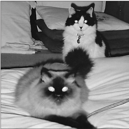
Compass and Kitty