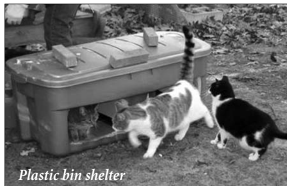
Plastic bin shelter