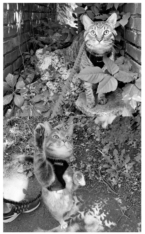
Dali and Bubbles enjoying their walks

Recently, Ellen commented: "It's been very rewarding to work with the cat project and with all the other wonderful volunteers. I've been very impressed with all that GNHCP is able to accomplish, and how dedicated the volunteers are." The truth is that GNHCP is equally grateful to have such a wonderful, creative and generous volunteer in Ellen.