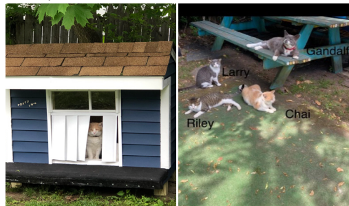
Left: Kitty in the outdoor shelter. Right: The other outdoor cats (clockwise) Gandalf, Chai, Riley, & Larry enjoying some quality time together